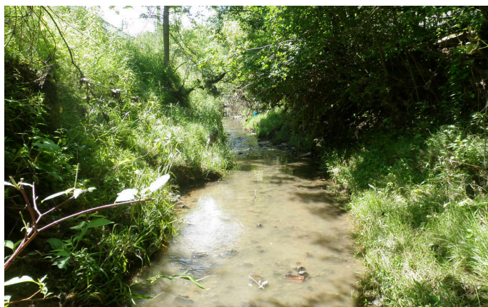
from top: Cross section detail of restoration concept; Initial conditions—a straightened and entrenched stream channel

After successfully completing the first phase of restoration of Bear Creek in 2012, the Tinker’s Creek Watershed Partners (TCWP) saw additional opportunities. TCWP contracted Biohabitats to help develop a conceptual design to address the entrenched